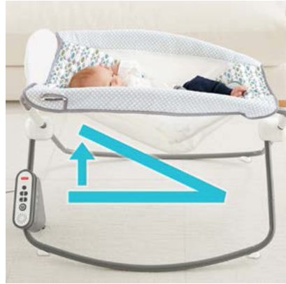
Above: Figure 2