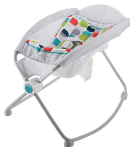
Above: Figure 1

32. A critical common design element of the Rock ’n Play Sleeper is a collapsible frame that supports a fabric hammock with tall sides (Figure 1), forcing the infant into a reclined position, with the head elevated at an approximately 30-degree angle from the lowest part of the baby’s torso (Figure 2) and restraints (Figure 3) that, if used as Defendants recommend, limit the baby’s motion at the hips and waist. There is a hard, plastic shell inside the hammock that is covered with soft padded material (Figures 4 and 5), upon which the baby is placed. Different views of the product are shown below: