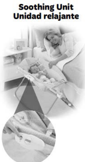
Above: Figure 11

129. The manuals are also deceptive in ways beyond the inadequate and misleading warning section. For example, the manuals show images of mothers lying down in bed, covered with blankets, which indicates either that they are ready for sleep or awakening from sleep. Below is an example: 52